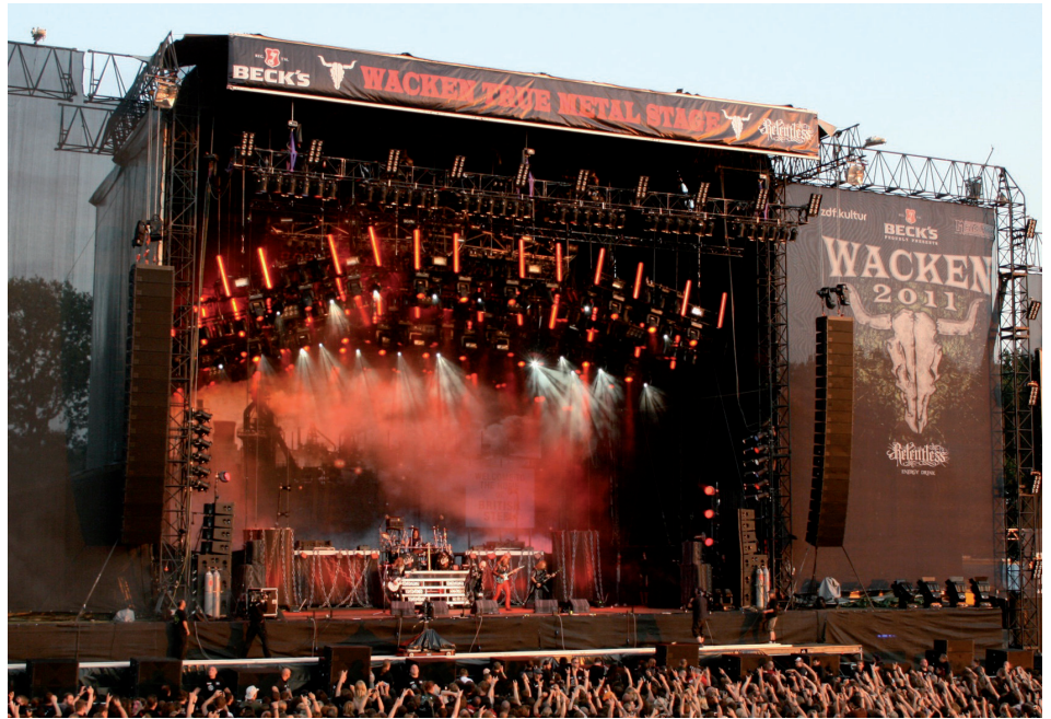
The Wacken 2011 open-air heavy metal festival.

company's headquarters. Among the salient characteristics of these products are the wealth of safety features with which they are endowed in order to equip them for compliance with such standards as BGV D8, D8 Plus, BGV C1 and DIN EN 61508 SIL1-SIL3. All the requirements and standards have