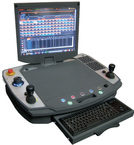
The Movecat Expert-T II.

Think Abele was originally founded as a distribution company. In 1996, however, with ten years of experience in the industry to draw upon, the company began to develop and produce devices of its own, these being the chain hoists and chain-hoist controllers that make up the Movecat range – a proprietary brand belonging to Think Abele – the products of which have been manufactured ever since at the