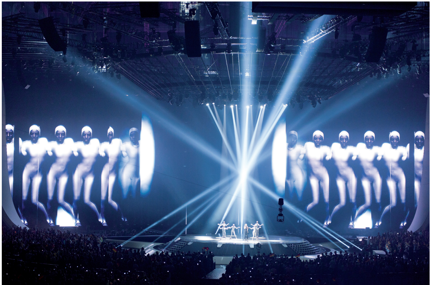
The German entry "Lena" at the Eurovision Song Contest 2011.

been strictly complied with, and yet these systems, which can be used in a modular fashion, are flexible, freely scalable and exceptionally user-friendly and can therefore be expanded to suit the greatest variety of show sizes. It is also possible to integrate this equipment seamlessly into pre-existing systems.