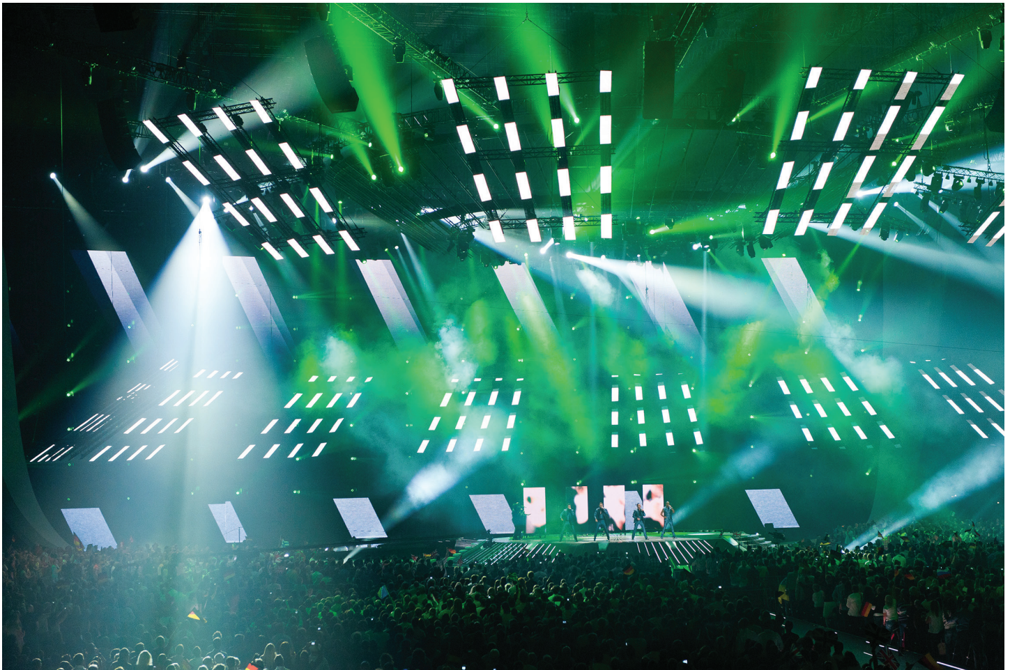
Movecat equipment was in action at Eurovision 2011 in Düsseldorf via event technology company Cape Cross of Cologne.

For Movecat, one of the world's leading suppliers of kinetic special equipment for use in shows and stage productions, the year 2011 is proving one of the most successful in the company's history. Material from Movecat, which is developed, produced and distributed by Think Abele of Nufringen (near Stuttgart), has been used, amongst many other major events, for the Eurovision Song Contest 2011, the production 'Faust XXL' at the Salzburg Festival, the production of Wagner's Tristan and Isolde at the Ruhr Triennial Arts Festival in Bochum and the world's largest open air heavy-metal festival in Wacken as well as for an installation in the Old Congress Hall in Munich.